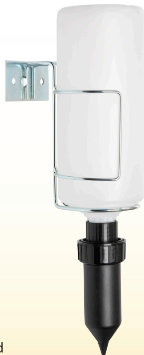
Wall hanger: #60023 UNRO Black: #60015