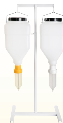
Adjustable table stand: #60018 Container (5L): #60024