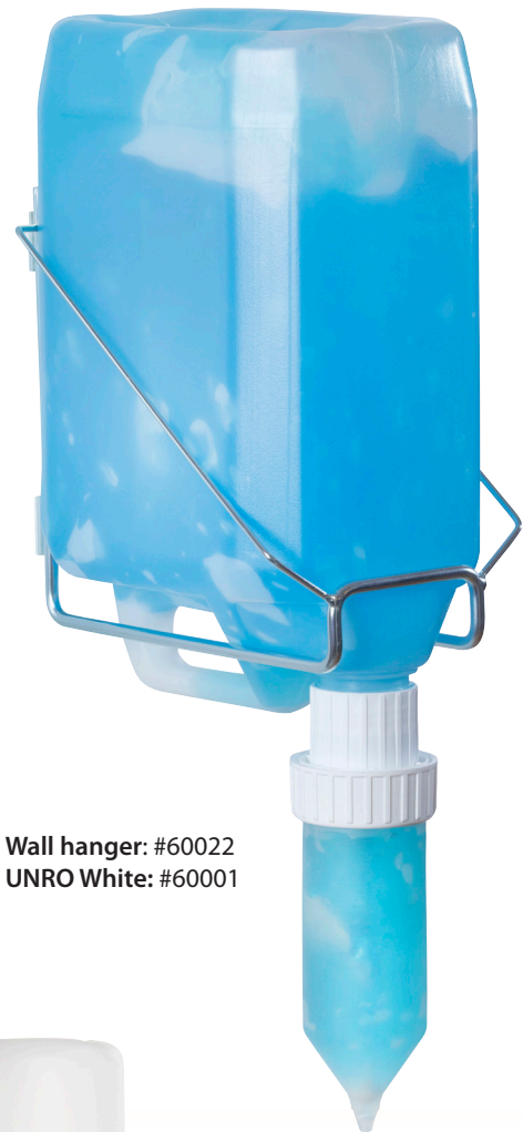
Wall hanger: #60022 UNRO White: #60001