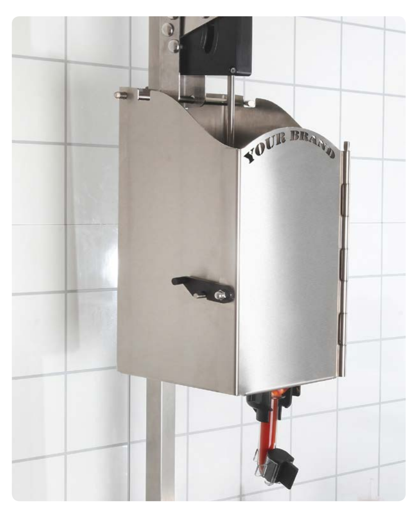
With a clear presentation of the brand, there will be no doubt which product brand the dispenser is designed for.

We work closely with you to customize a specific solution to fit your needs. Together we can create the design and choose how to display your brand on the dispenser. Whether with stickers, or with a stylish laser cut, the Asept Pressomat Dispenser will make your brand stand out. Our solution with a proprietary fitment ensures that no other product can be used in your branded dispenser.