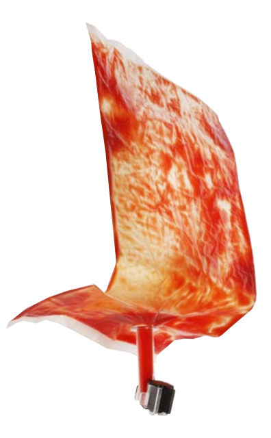
With the Asept Pressomat Dispenser the flexible pouch can be efficiently emptied, offering a very high yield and a minimum of waste.