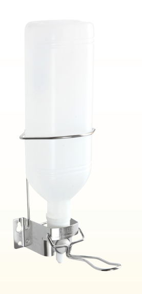
Wall bracket: #717210